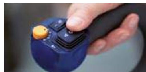
Control unit and handles were designed according to the latest ergonomic findings.

With the c-max aviation you can manage almost all types of stairs. Regardless of whether you are inside or outside, facing winding or straight stairs, the device climbs safely and comfortably.